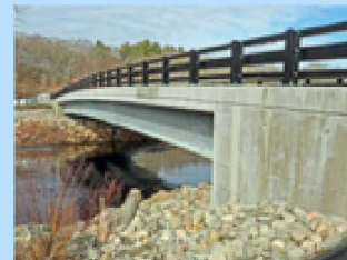
Roads & Bridges